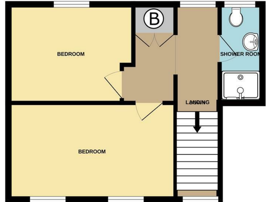
1ST FLOOR 387 sq.ft. (36.0 sq.m.) approx.